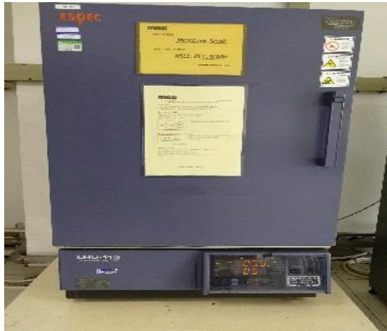
ESPEC Temperature/Humidity Chamber