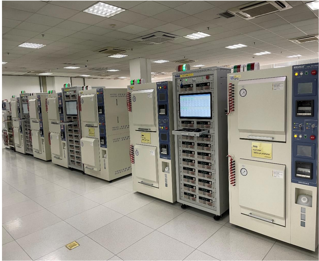
HARIYAMA HAST/UHAST/AC Chamber