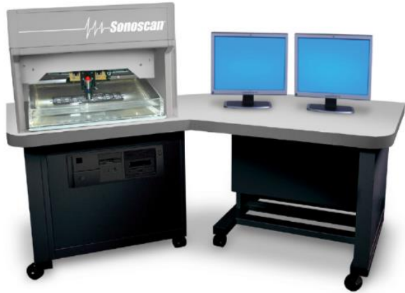
SONOSCAN C-SAM 9500D