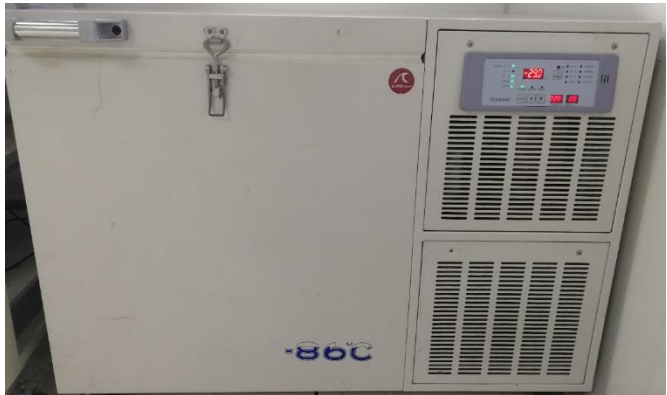
Low Temperature Chamber