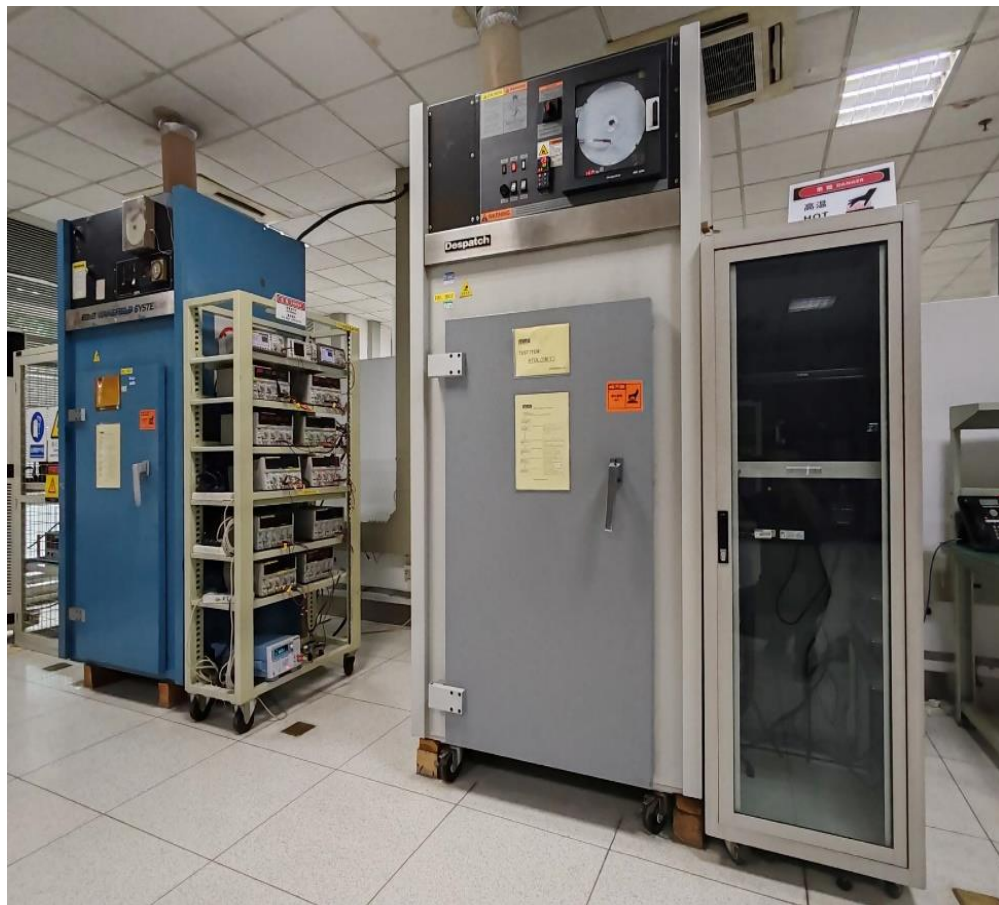
DESPATCH HTOL SYSTEM