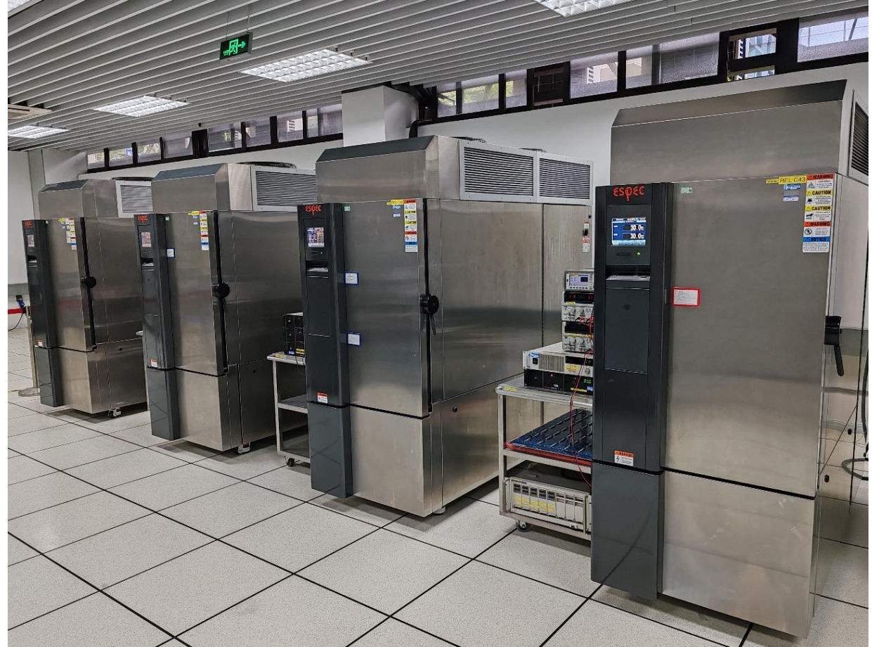
ESPEC Power Temp. Cycle Chamber