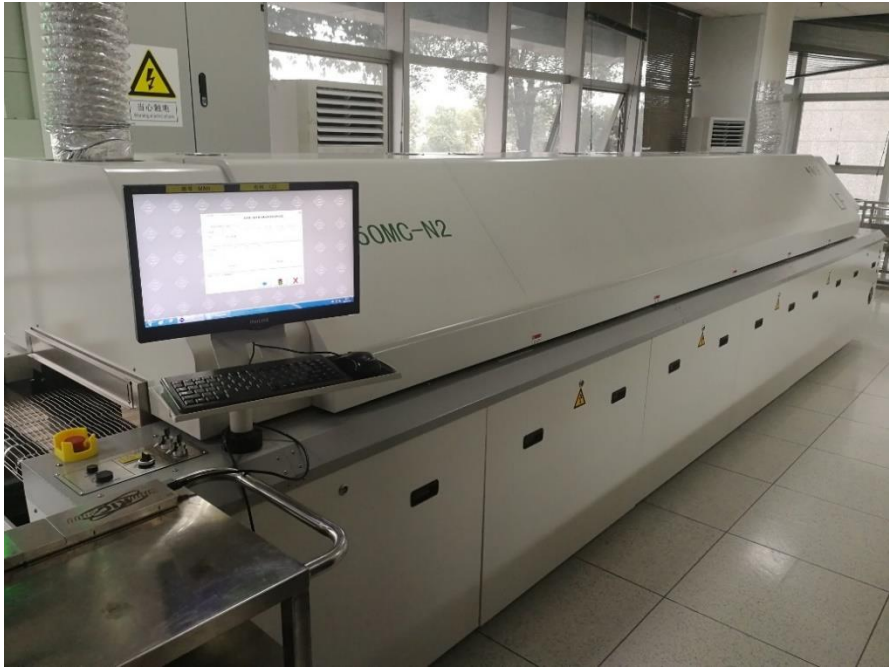
10-Zone Reflow Oven