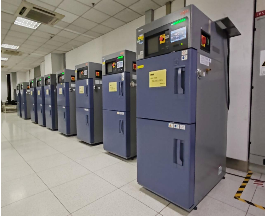
ESPEC Temp. Cycle Chamber