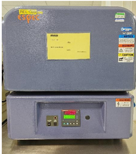
High Temperature Chamber