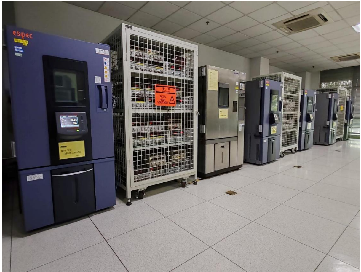
ESPEC THB/UTHB Chamber