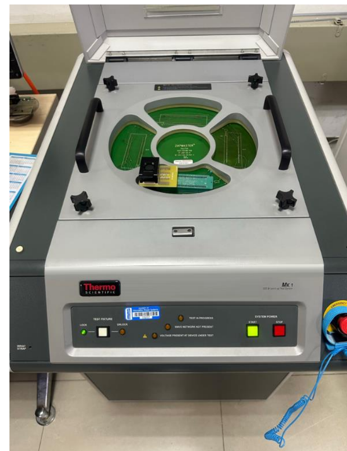
HBM ESD/Latch-up Machine